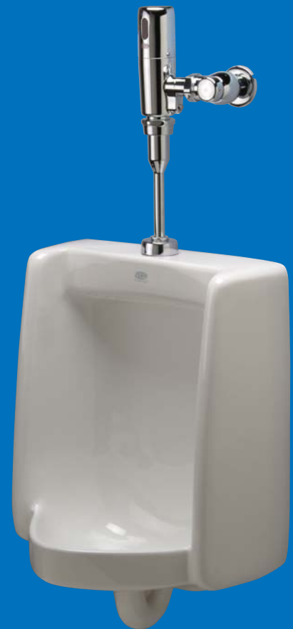
Zurn Z5798 Pint Urinal

Along with green roofing systems, solar technology, self-conserving sprinkler systems and recycling programs, LMU has recently completed a retrofit plumbing project that includes both Zurn 1.28 gpf High Efficiency Toilets and Zurn Pint Urinals.